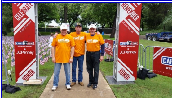
Members of the Veterans Center of North Texas volunteering at the 2015 Carry the Load Memorial Day event.