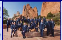
ANG Band of SW

DO NOT MISS! This is the Air Force's year and it will be an evening to remember. The Gala will be held April 16, 2016 at the Fairmont Hotel Dallas. All of the AFA Symposium Panel will be in attendance. The annual black-tie dinner and military gala bring together key leaders in the Dallas-Fort Worth region to honor the men and women of the Armed Forces. Chief of Staff of the United States Air Force, General Mark A. Welsh, will be the keynote speaker. Attendees, including military personnel and spouses, local dignitaries and industry executives will enjoy performances by the United States Air Force Honor Guard Drill Team and the Air National Guard Band of the Southwest.