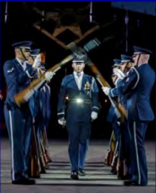
USAF Honor Guard Drill Team