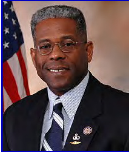
Mr. Allen B. West

Lieutenant Colonel Allen West believes it will be principled constitutional conservative policies, not politics, which secures a sound economic future for Americans – with growth, opportunity and returning the promise of the American dream for this generation and those to come.